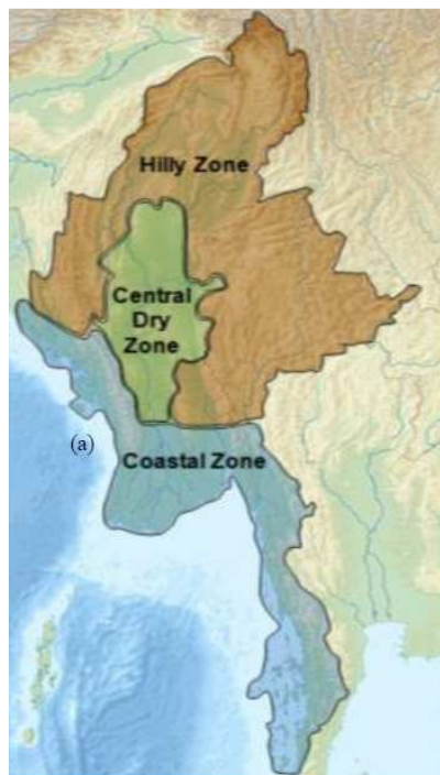
Figure 1: Agro-ecological zones of Myanmar